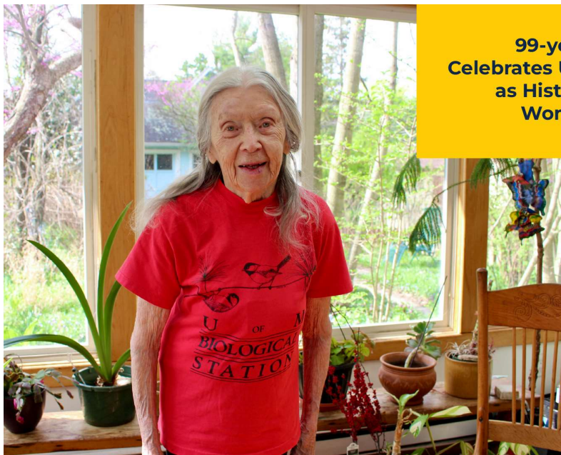
99-year-old Alumna Celebrates U-M Biological Station as Historic Advocate for Women in Science