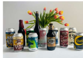
MICHIGAN CRAFT BREWS