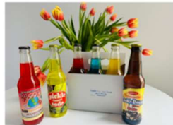
SODA POP FROM ROCKET FIZZ