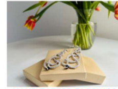
HAND TATTED EARRINGS