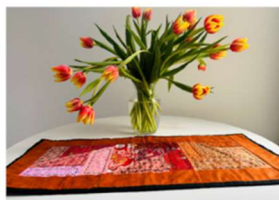
TABLE RUNNER QUILTED BY ASHER