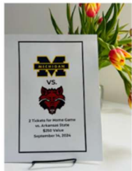
TWO PAIRS OF UM FOOTBALL TICKETS