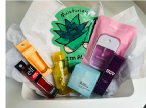
TEEN SKIN CARE BASKET