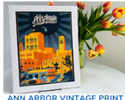
ANN ARBOR VINTAGE PRINT