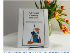
HOUSE CLEANING SERVICE