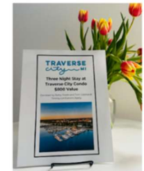
3 NIGHT STAY IN TRAVERSE CITY

OUR SILENT AUCTION WILL GO LIVE ON SUNDAY AT 8:00A. MEMBERS OF OUR TEAM WILL BE READY TO HELP YOU SET UP YOUR ONLINE BIDDING.