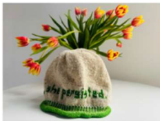
HAT KNIT BY STACEY