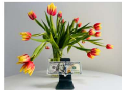
100 DOLLAR BILL