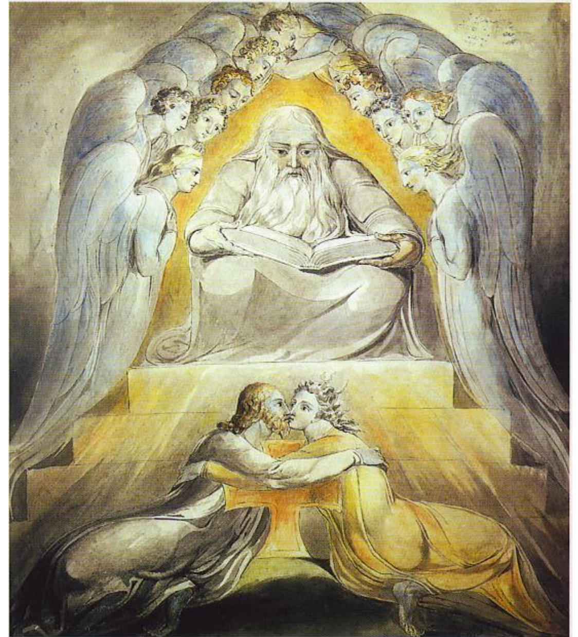
Mercy and Truth are Met Together, Righteousness and Peace have Kissed Each Other William Blake (1757-1827)